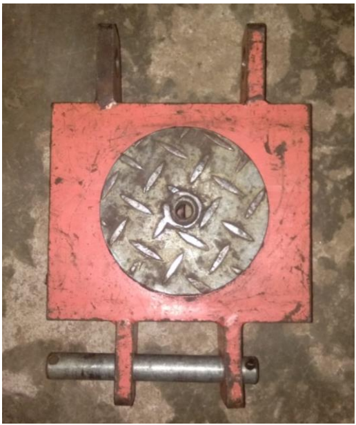
Fig 3(a) Bottom side of the roller showing four PU wheels Fig 3(b) Top view of roller

Each roller has 4 PU wheels of diameter 70mm and length 80mm.Each wheel designed for load carrying capacity of 750kg. Thus, Total Load carrying capacity of roller = 750kgx4=3000kgper roller.