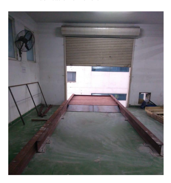
Fig 2. Inside view of the setup of rail guides for moving machine

Four rollers each having four PU wheels (which does not damage the epoxy coating of the shop floor)were used beneath platform for balancing and moving machine to its required place. Fig 3(a) shows the four wheels used in one roller while Fig 3(b) shows the top view of the roller.